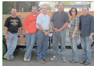
2010 Picnic Table Donation